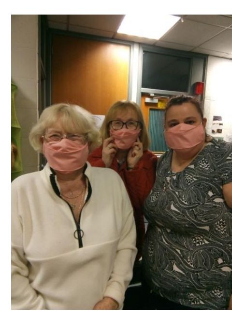
Helpful products from Sewing Classes in Hub

Letham4Alll and the Letham Community Hub continue to offer support to a range of local groups and organisations by offering free and low-cost room hire and hosting funding to enable community groups with bank accounts to operate. Examples of this are Knit and Natter Group, The Letham Friendship Network, Breast Feed Supporting Group, Chatty Crafters, Creative Writing Group and the Family Fun Group. Local organisations using the Hub include The Letham Majorettes, Vibe Dance, Letham Community Sports Club, Badminton Group and faith-based organisations.