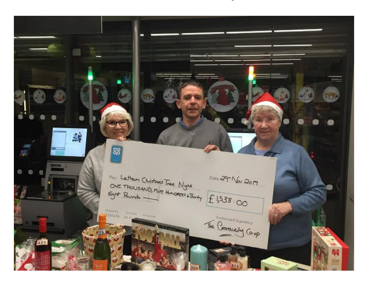
Fund raising for Christmas Tree Event

By developing reserves, Letham4All will be able to cope with any unexpected issues and which in the long-term future help request a community asset transfer of the building which they operate as the Community Health and Well Being Hub, from Perth and Kinross Council to the community.