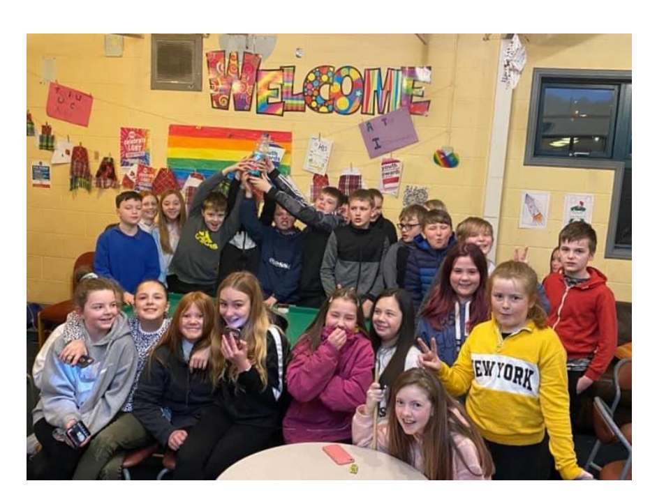
The Inbetweeners Youth Group

Letham4All made a successful application to Paths for All to engage a Health Walk Worker to implement the Walks4All Project. Starting in September 2019, the worker undertook routed planning and risk assessments and very quickly launched the project at the Better Place to Live Fair and has delivered weekly health walk to average of 8 local people. Plans were afoot to deliver an additional walk in the Tulloch area in partnership with Tulloch Net and link in with local parents to deliver regular buggy walks. Unfortunately, due to COVID 19 pandemic this activity has been paused but will restart when it is safe to do so.