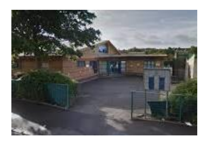
Letham Community Hub