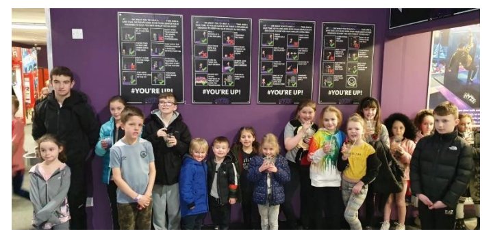
Family Fun Club activities

The Inbetweeners Youth Group continued to operate on a weekly basis with an average of 20 young people attending. This very popular youth group has enabled young people to take part in a range of activities including cooking, arts and crafts and sports. It has enabled one young person to volunteer on a regular basis and is now enrolled on the Saltire Award Programme. Youth Worker also support the young people to take part in Hi5, Dynamic Youth and Youth Achievement Awards. Letham4All is engaging with them to help scope out an expanded Letham4All Youth Work Project and to involve them in making an application to the National Lotteries Young Start Fund.