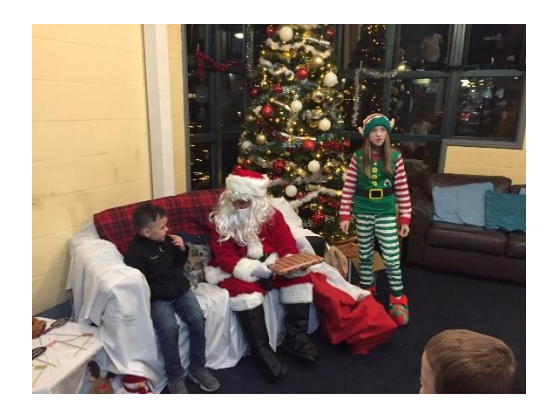
Christmas Fayre 2019

Letham4All SCIO continued to work with Perth and Kinross Council (PKC) to seek external funding to achieve the aspiration of extending and refurbishing the building as set out in the original plan for the building in 2018. Letham4All working with PKC to submit a final application to the Scottish Government's Capital Regeneration Fund and were delighted to find out in February 2020 that the £1million application had been successful. In the same month PKC agreed to invest a further £1 million in the redevelopment. Letham4All were also working on an application to the National Lottery's Community Asset Fund for £500,000 for the project but to be able to secure this funding Letham4All must own the building. To start this process Letham4All submitted a community asset transfer expression of interest to the Council in December 2019. If successful, the Letham Community Hub will become a community owned asset in the future.