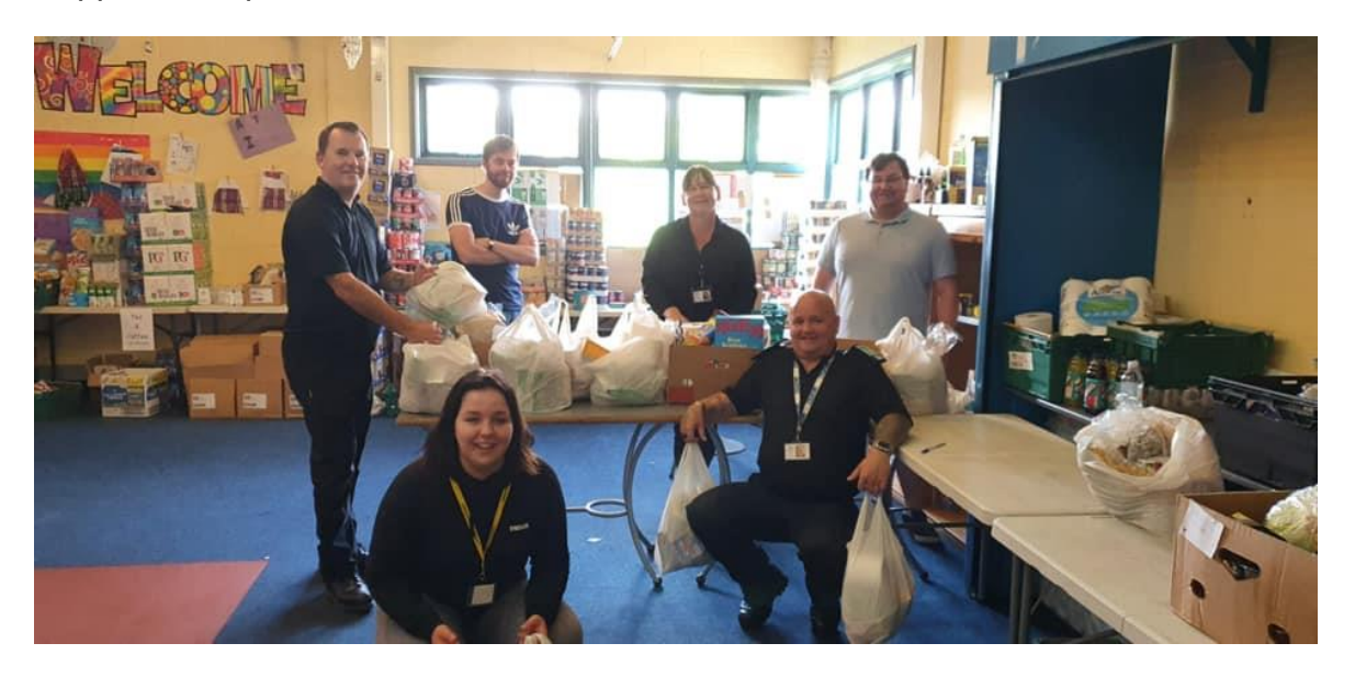
Working together to deliver food parcels

The level of activities, services and commercial lets in the Hub were exceeding our expectations which all came to an end with the impact of the COVID 19 pandemic and by middle of March nearly all the activities in Letham Community Hub came to an end. However, the building was allowed to remain open to deliver the Community Fridge4All Project and very quickly Letham4All joined a number of other community organisations to form the North Perth COVID 19 Community Support Group.