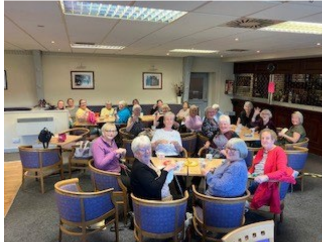
Monday night's Knit and Natter Group

We have continued to take an active role as a Community Anchor Organisation. Doing this we can support grassroots and constituted community organisations to deliver their invaluable support to people in our community. An great example of this is the Letham Friendship Network and Knit and Natter Groups, which are growing stronger and more popular in the community.