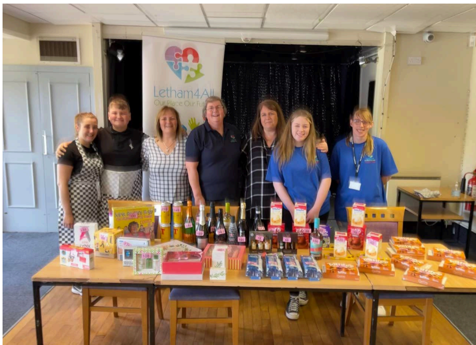
Letham4All Staff and Volunteers at the Big Community Breakfast